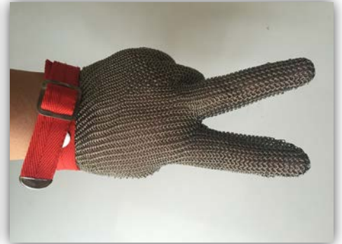
Fastened strap of chainmail gloves