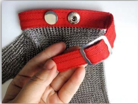
Front view of fastening buttons