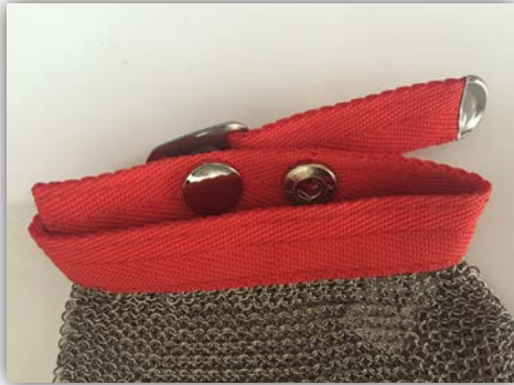
Lateral view of fastening buttons

Chainmail gloves has adjustable wrist straps at least 18 mm. Wrist straps aim to stop gloves falling off.