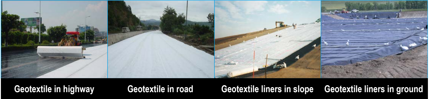
Geotextile in highway