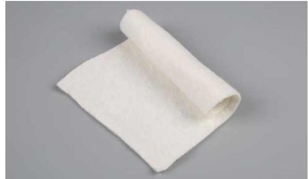
Short fiber geotextile fabric