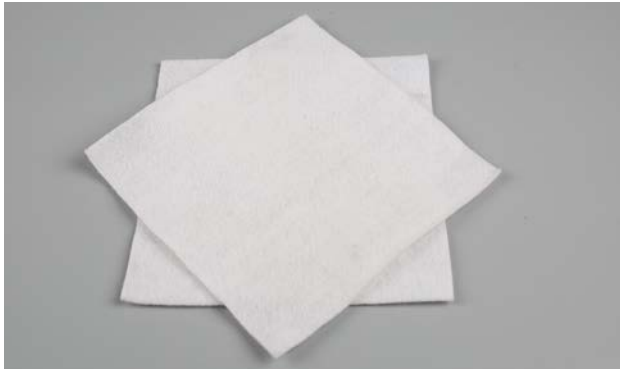
Long fiber geotextile fabric